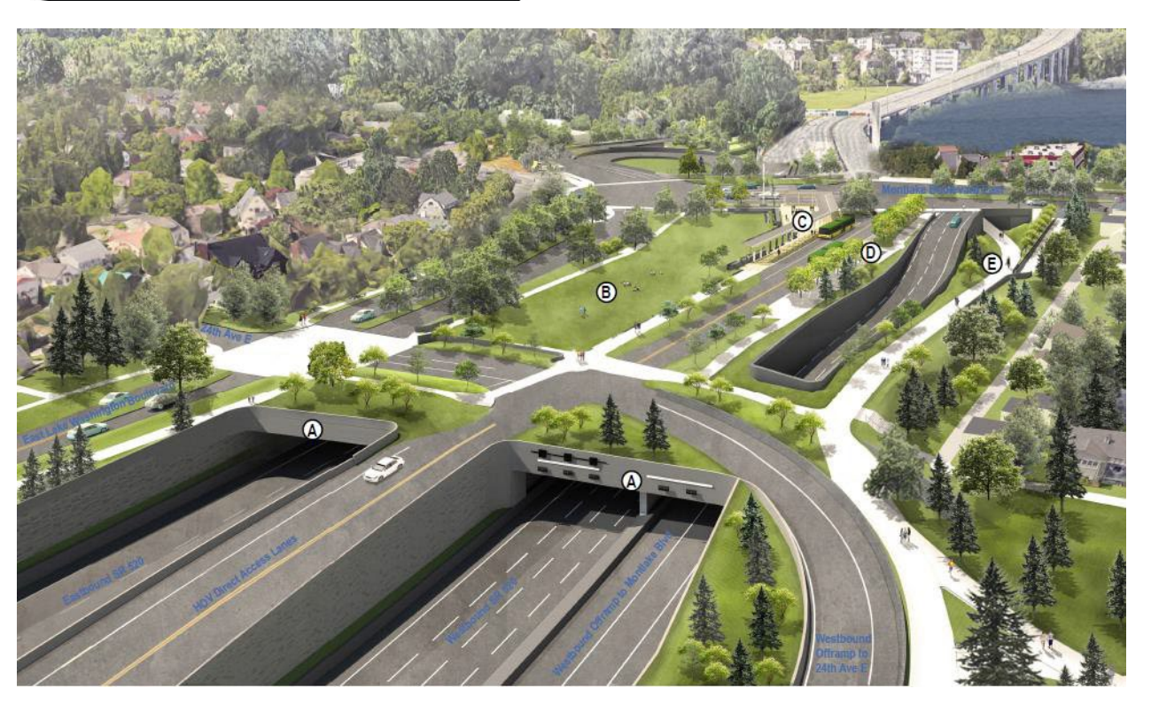
Figure 2 Final configuration looking west. For reference: A – West Portal; B – Neighborhood Open Space; C – South Montlake Plaza; D – North Montlake Plaza; E – SR 520 Trail