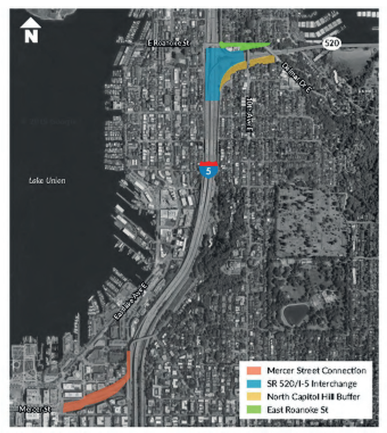
Tree and Vegetation Management and Protection Plan January 2020

Exhibit A-1: SR 520/I-5 Interchange Project Area Map and Management Area